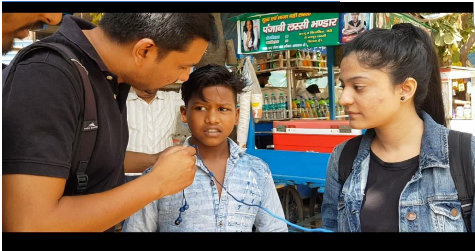
Awareness on Road Safety