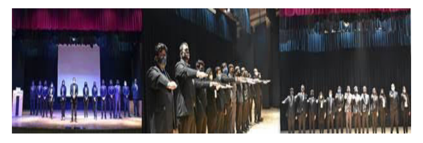
SDC - 2019-20