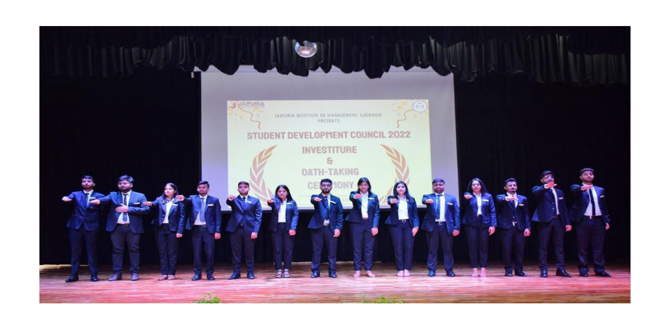
SDC - 2021-22